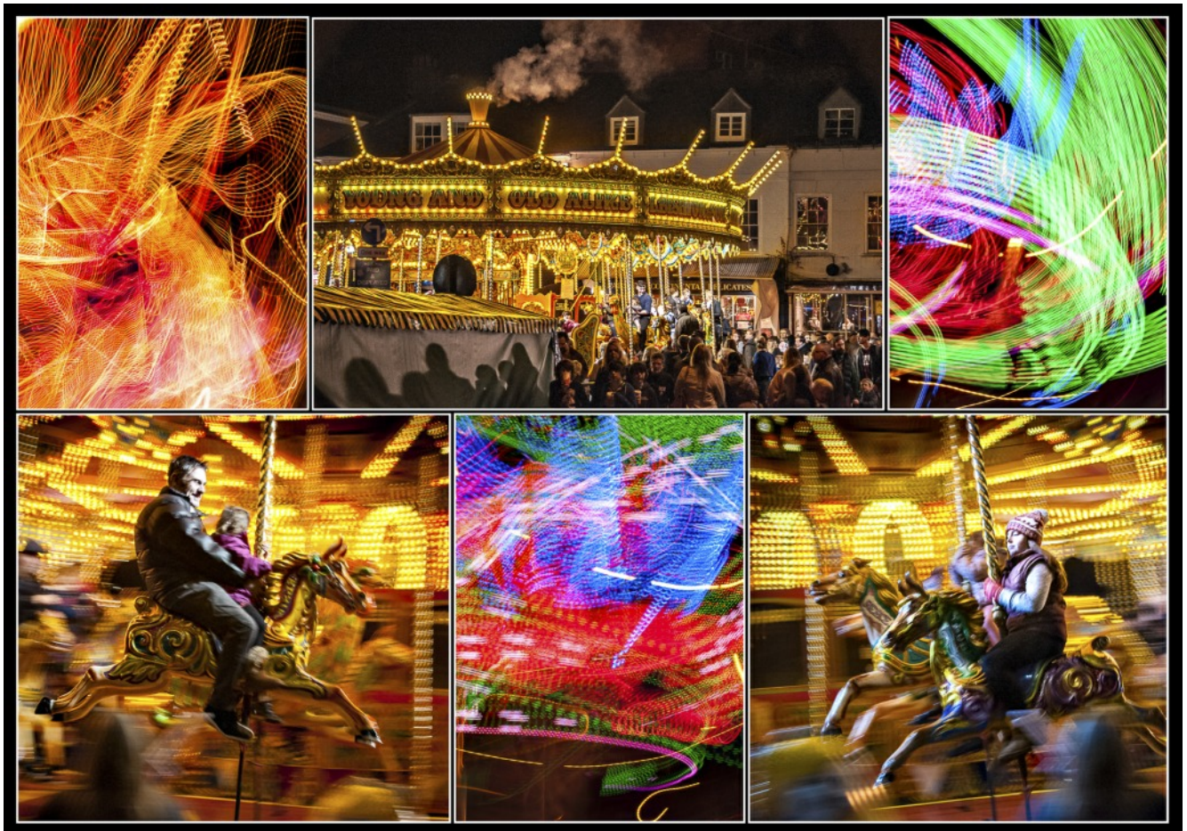
Victorian Fayre - Funfair Impressions by Clive Haynes FRPS

Sunday January 25 th Fotospeed Lecturers' Day