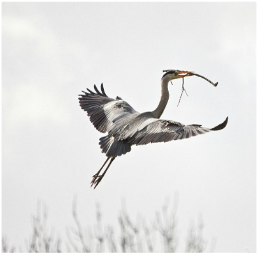
Grey Heron Nesting