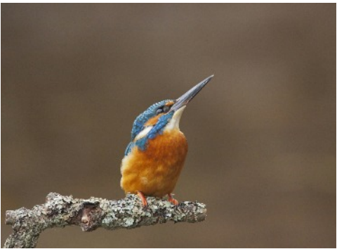
Below: Kingfishers: Right: Goldfinch on Teasel