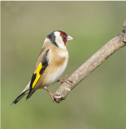
Leftt: Goldfinch Above: Female Kestrel, Kestrel feeding, Right: Kestrel with prey.