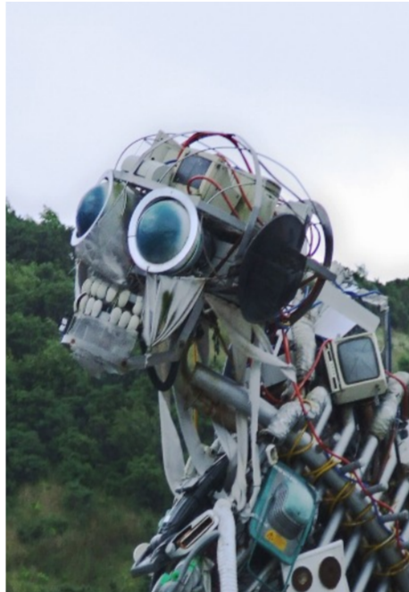
The WEEE man at the Eden project: his teeth are computer mice; his ears are satellite dishes; and his brain is built from computer parts.